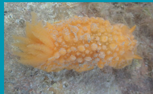
Warty Doris Doris Verrucosa