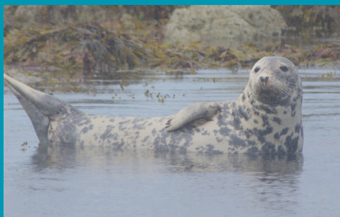
Grey seal Halichoerus grypus