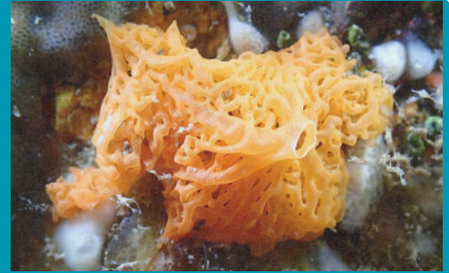
Calcareous sponge Clathrina rubra