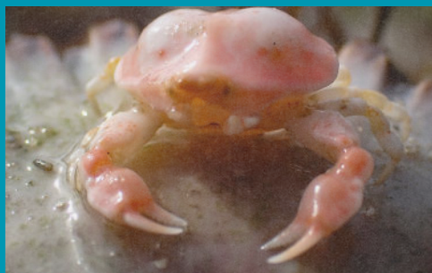
Bryer's nut crab Ebalia tumefacta