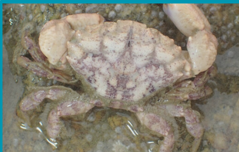
Risso's crab Xantho pilipes