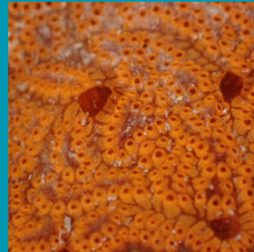
Sandiego sea squirt