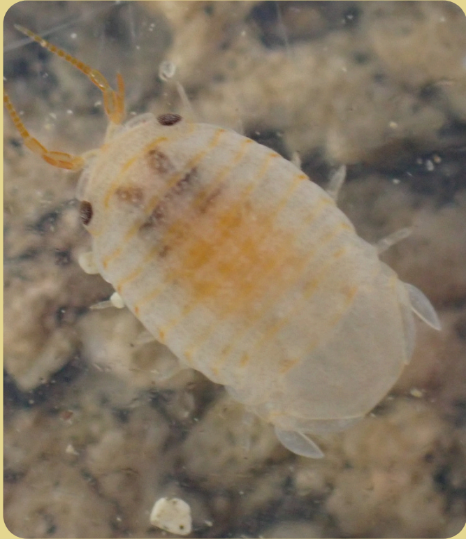
Sphaeroma serratum Isopod