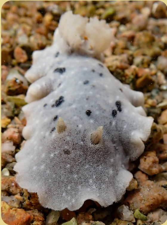
Jorunna tormentosa Velvet Dorid