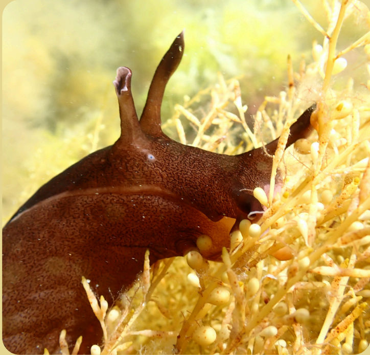
Aplysia punctata Seahare