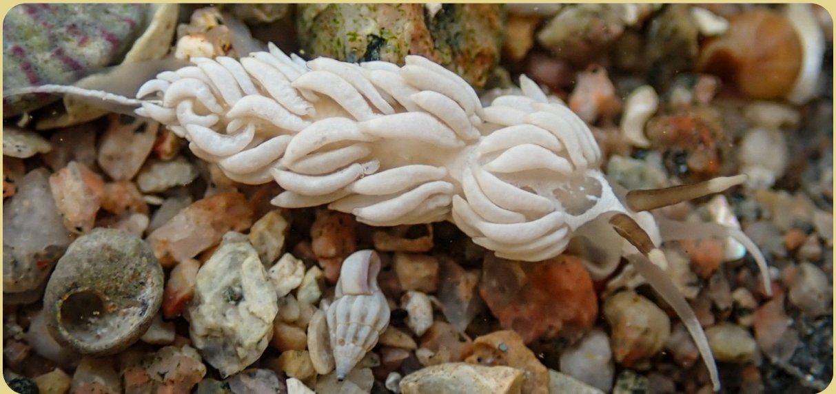
Favorinus branchialis White Aeolis