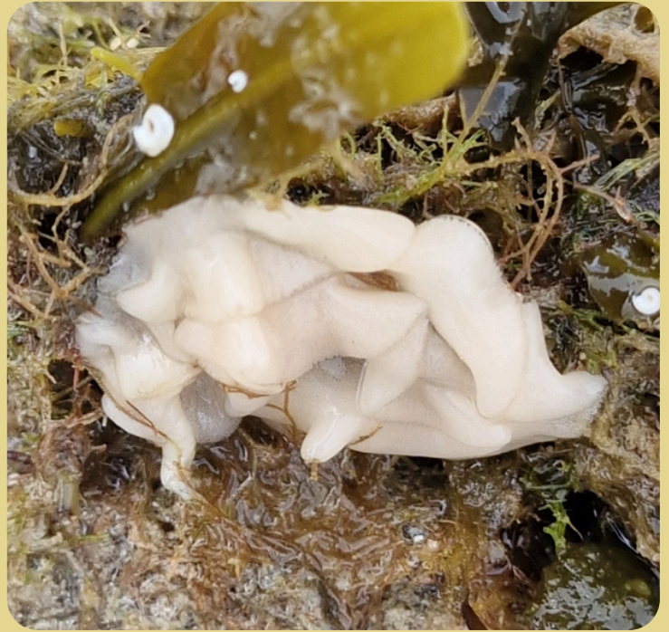
Velvet Dorid egg cases