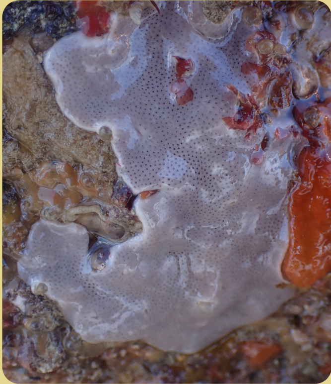
Lissoclinum perforatum Tunicate