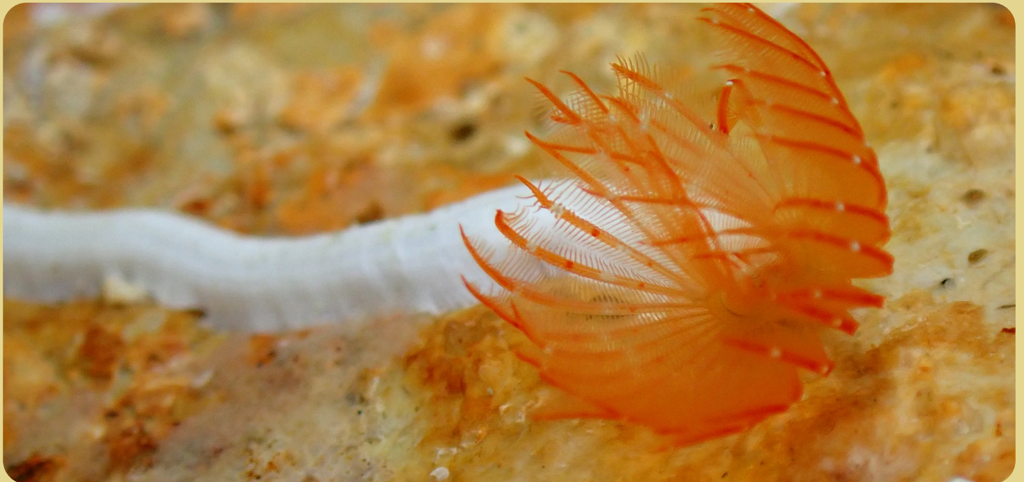
Protula tubularia Red spotted horseshoe worm