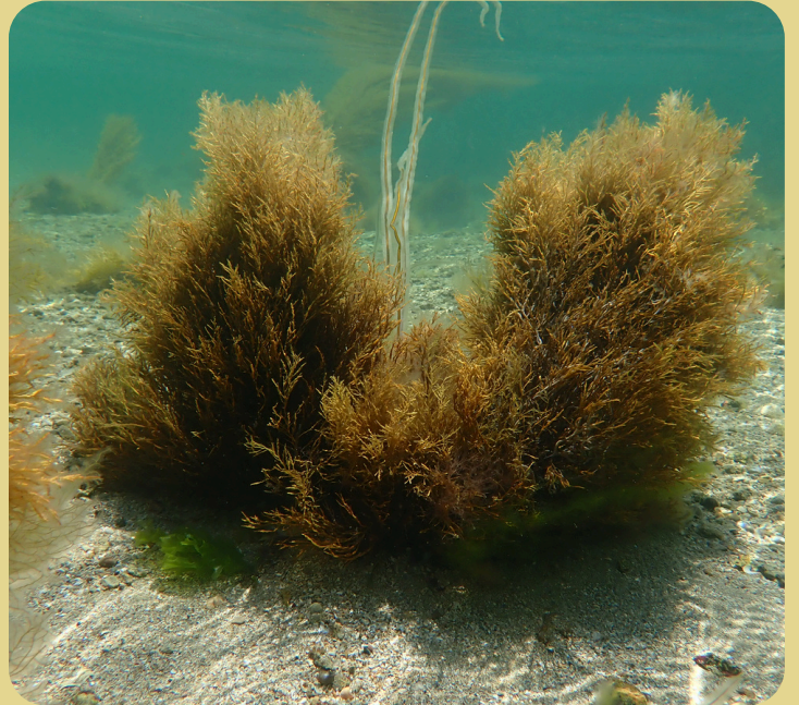
Gongolaria baccata Bush berry wrack