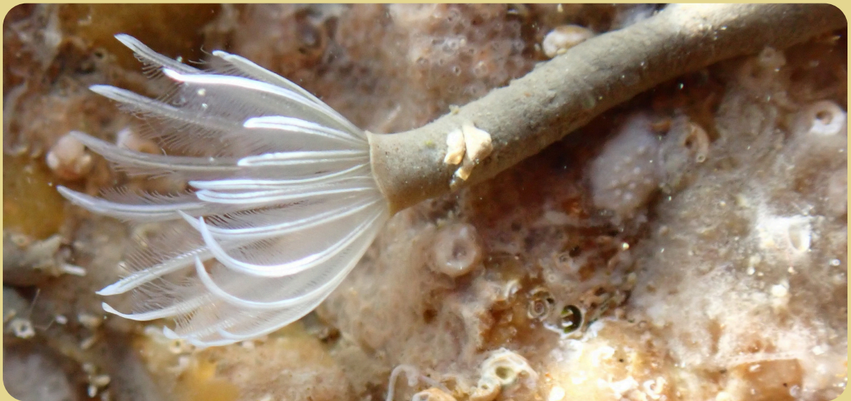
Sabellidae Feather duster worm