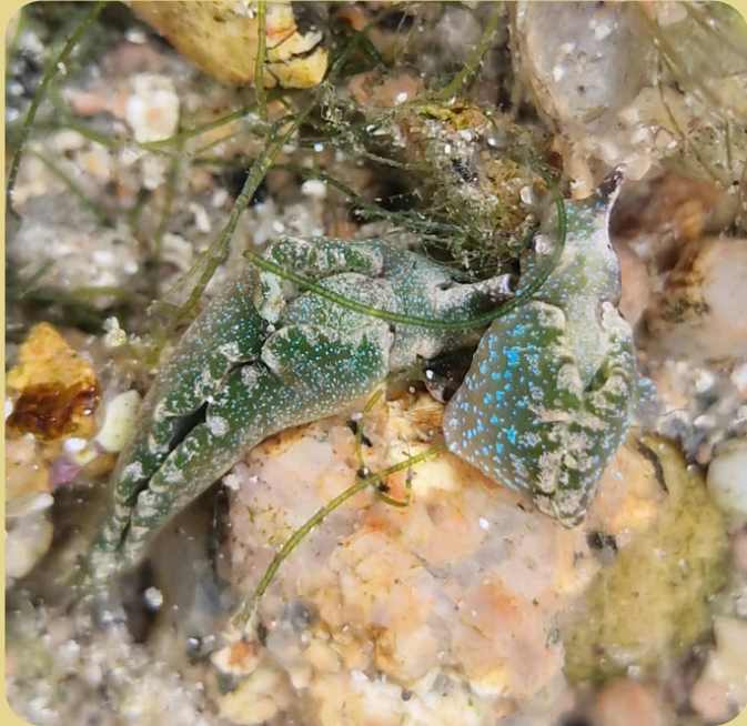
Elysia viridis Sap-sucking sea slug