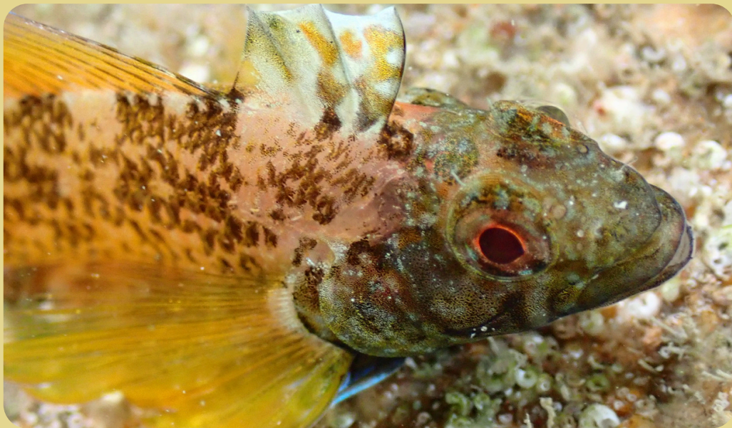
Tripterygion delaisia Black faced blenny