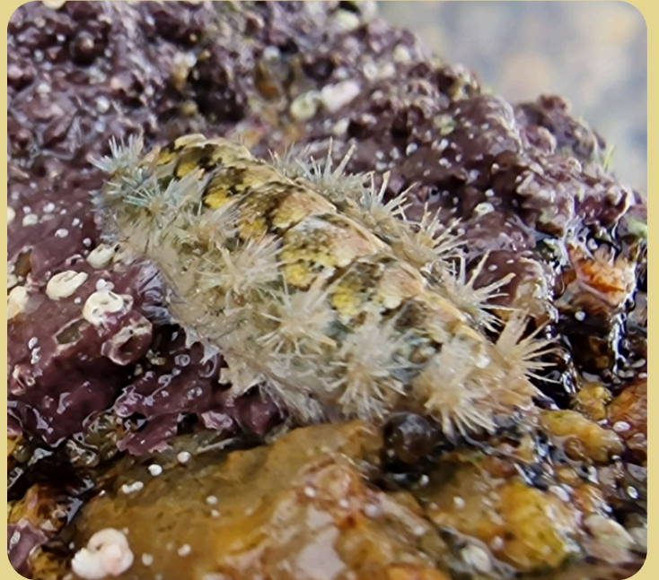
Acanthochitona sp Bristly chiton