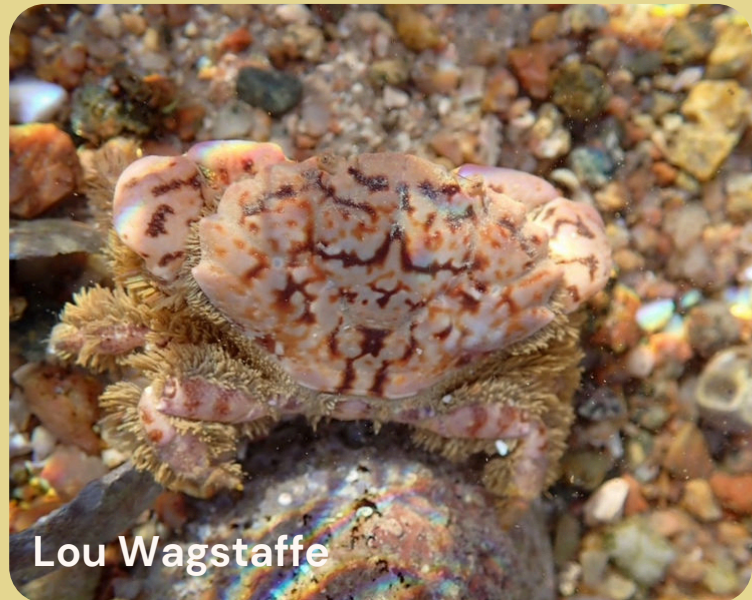
Risso's Crab Xantho pilipes