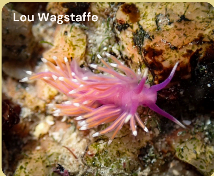
Pink Coryphella Edmundells pedata