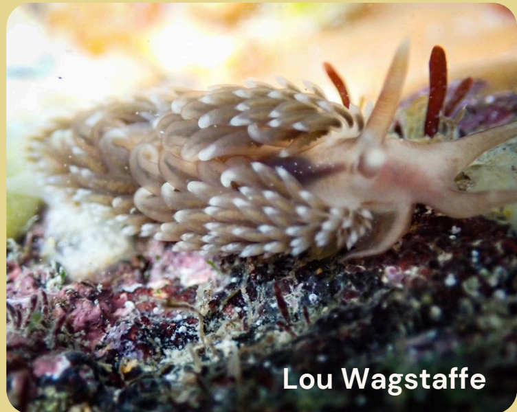
Ringed Aeolid Pruvotfolia pselliotes