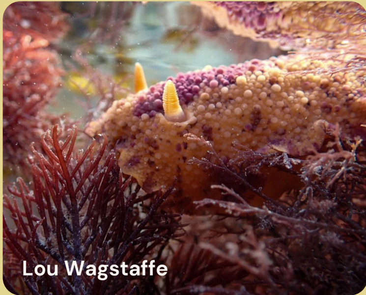
Sea Lemon Doris pseudoargus