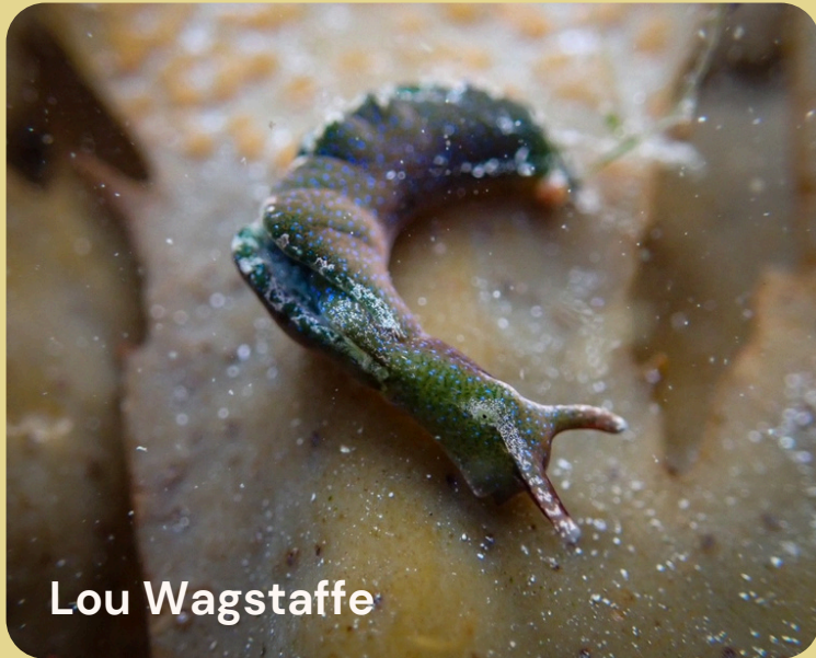
Sap-sucking Sea Slug Elysia viridis