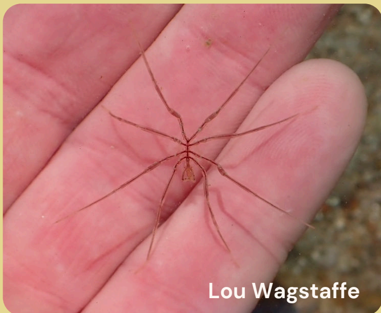
Gracile Sea Spider (aka the Gangly Lancer) Nymphon gracile