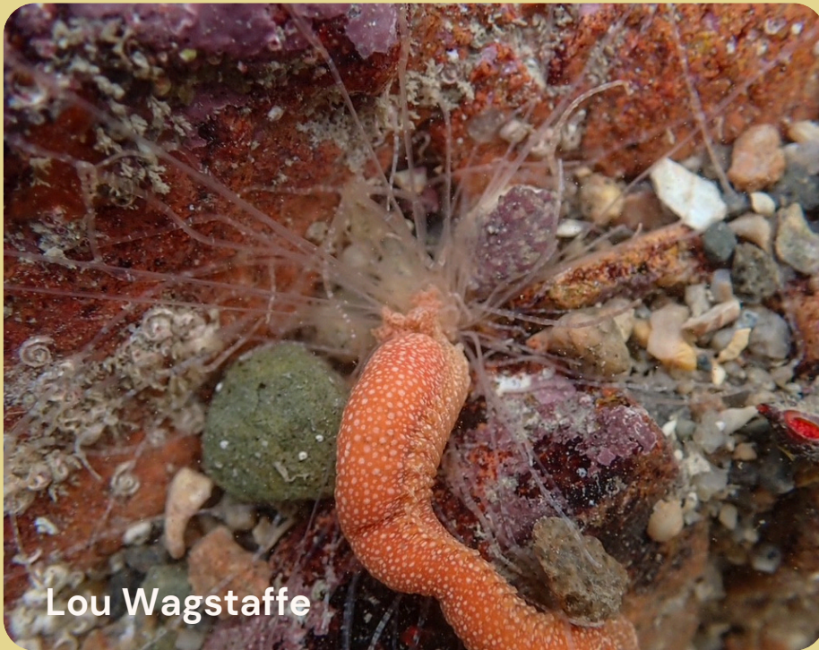
Eupolymnia nebulosa (Strawberry Worm)