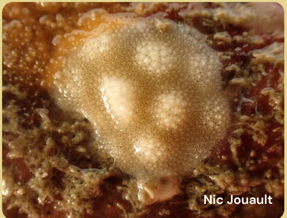
Disporella hispida (Bryozoan)