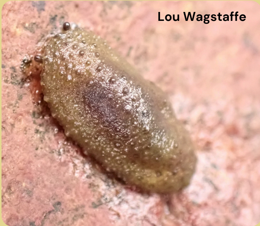
Onchidella celtica (Celtic Sea Slug)